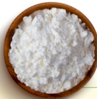
Multi Grain Flour