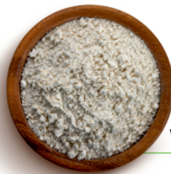
Whole Wheat Flour