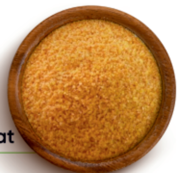
Broken Wheat Daliya